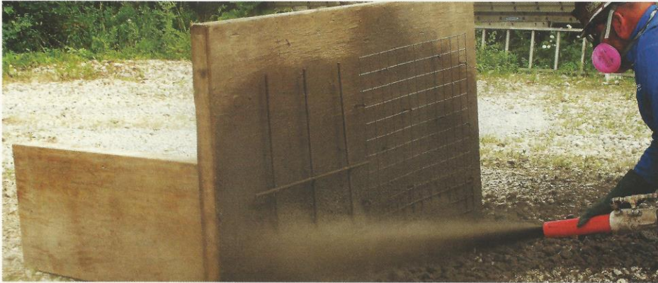
Fig. 5: Preparation of a shotcrete test panel