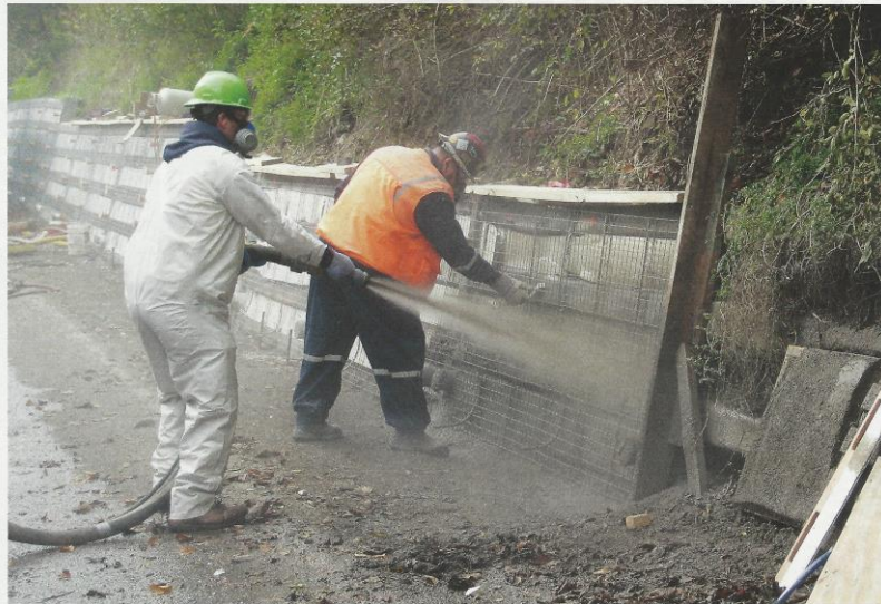
Fig. 1: Dry-mix shotcrete being installed on a retaining wall project

When selecting a method of placement, the finished product is rarely a determining factor. Other than a few small technical differences, the