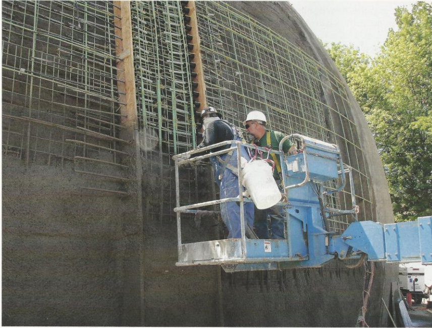
Fig. 2: Wet-mix shotcrete installation at dome structure

material is all the same once it hits the substrate regardless of application method. The determining factors are scope of work, availability of materials, availability of equipment, site access, and contractor preferences.